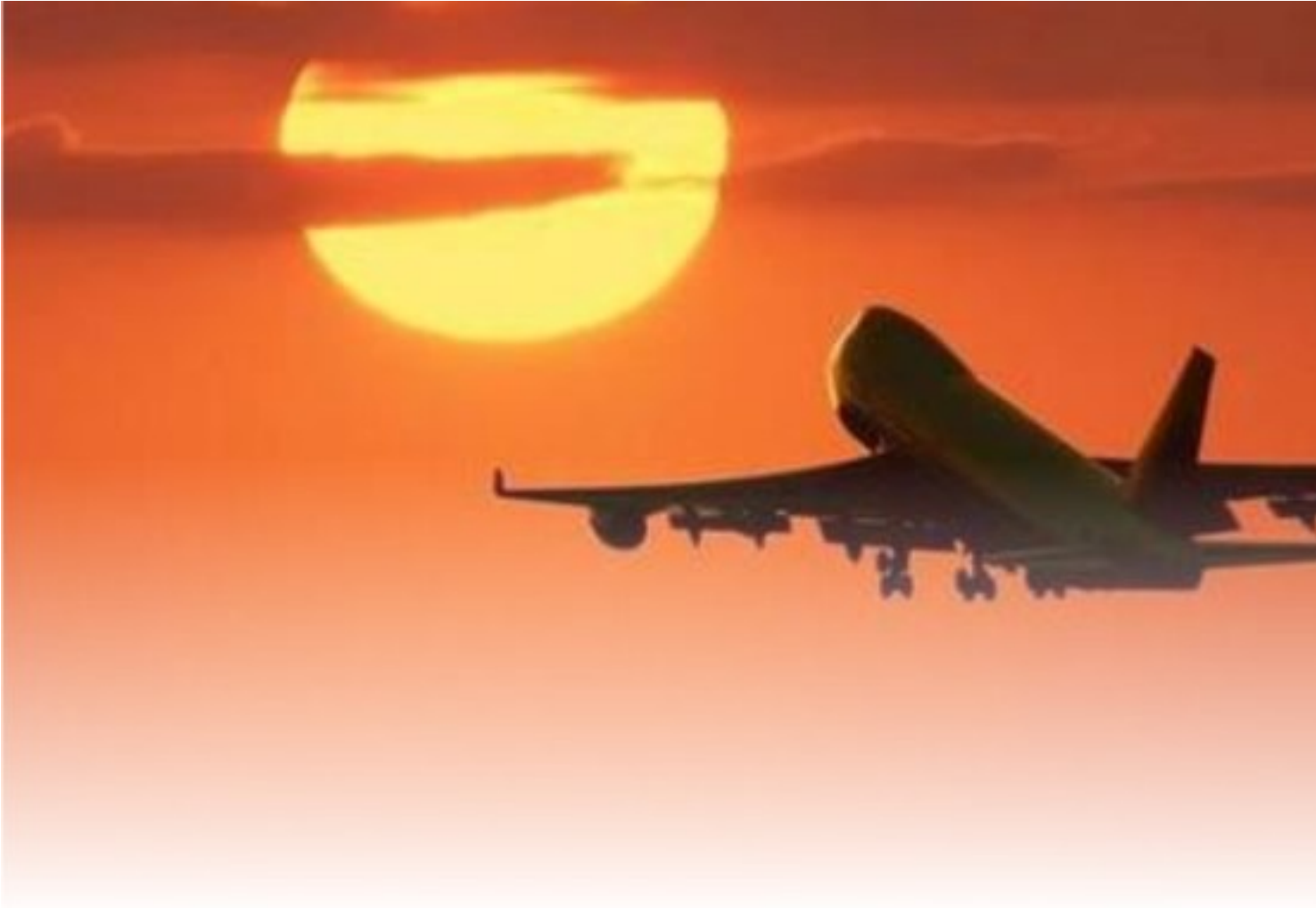
The ironies of it all: How 'Áígreen' Áí is 'Áígreen' Áí.